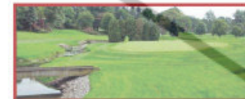
#5 - "Double Trouble"