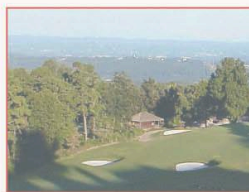
10th - "Cape"