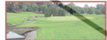
#5 - "Double Trouble"