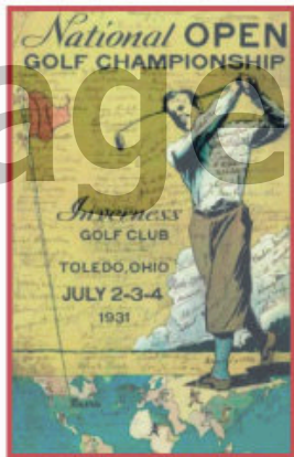
1931 National Open