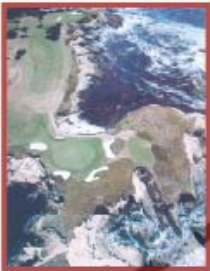
#16 green and #17

No 1 400 yards par 4 No 10 477 yards par 5 No 2 244 yards par 3 No 11 483 yards par 4 No 3 184 yards par 3 No 12 411 yards par 4 No 4 384 yards par 4 No 13 361 yards par 4 No 5 400 yards par 5 No 14 367 yards par 4 No 6 221 yards par 3 No 15 180 yards par 3 No 7 150 yards par 3 No 16 253 yards par 3 No 8 326 yards par 4 No 17 270 yards par 4 No 9 324 yards par 4 No 18 290 yards par 4