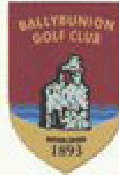
"The Old Course"